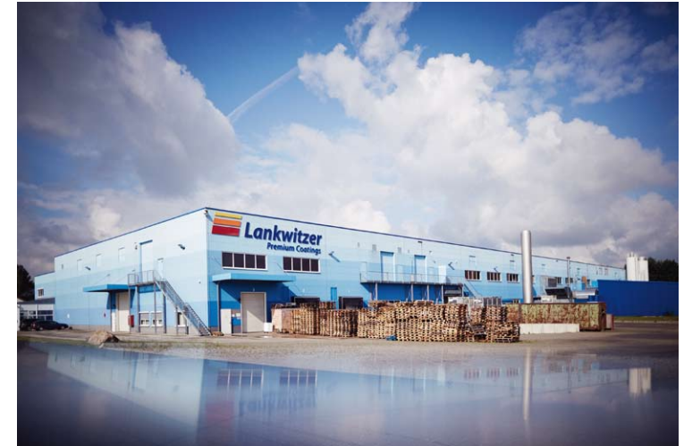
Lankwitzer Lackfabrik GmbH